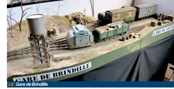
L8 Gare de Brindille

Brindille (meaning a twig or branch, in French) is a 16mm scale SM-32 model railway, using 32mm gauge track on which narrow-gauge locomotives and rolling stock run. The layout was originally created by Chris Hopper. It represents a small inglenook shunting layout and represents a First World War WD light railway. The track is from Peco's range, while the rolling stock is a mixture of kit built and 3D printed vehicles. The locomotives are DCC controlled while the points are DC operated. We look forward to exhibiting Gare de Brindille which is a tribute to those who lost their lives in the Great War. Layout size 10ft. X 2ft.