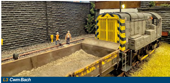
L3 Cwm Bach

L3 Cwm Bach Mark Wilson Cwm Bach (Translation: little valley) is a fictional location somewhere in the South Wales Valleys, a few miles from Pontypridd but not to be confused with the real Cwm Bach near Aberdare. The model is presented as a rundown late 1980s single track branch line with a small platform and a DMU service. The line was once double tracked and continued through a tunnel, but that was closed many years ago and only remains today because it is a reversing point for freight, which is mostly civil engineering and waggon repairs. There's no space for a run round loop which necessitates some shunting, and there's generally an O8 or two to be seen. The layout length is 10 feet.