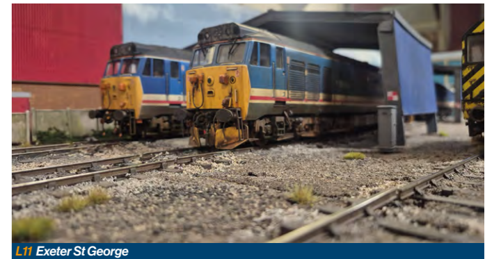
L11 Exeter St George

Exeter Saint George is a compact layout showing how little space you need to depict a fair sized stabling and refuelling point. It is based on Exeter St Davids in 1991. The majority of the traction seen are Class 50s, modelled as they ran at the end of their BR careers. There are also the occasional 33s and 37s and other visitors to the small depot. All the locomotives are DCC sound fitted and have been accurately finished as they were in 1991. The layout measures 10 ft. x 2ft.