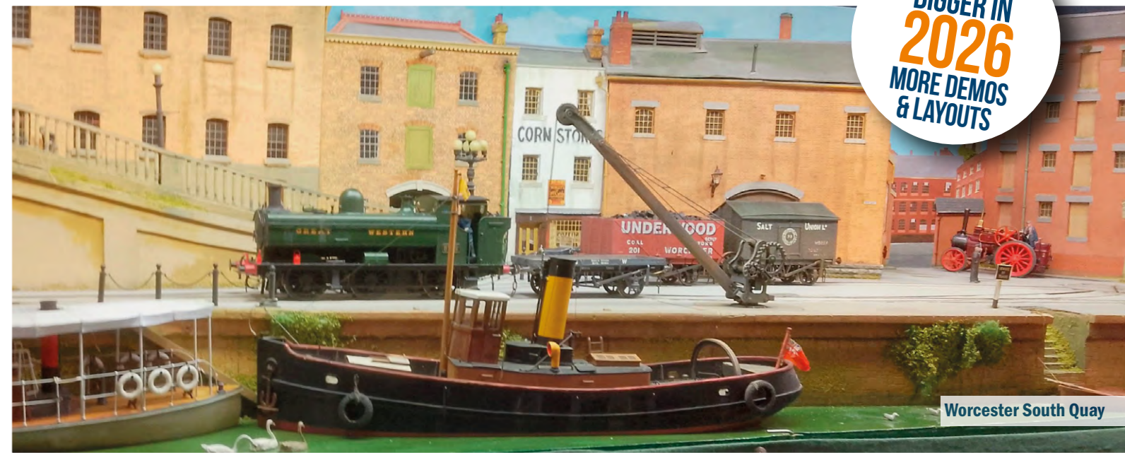
Worcester South Quay

EVEN BIGGER IN 2026 MORE DEMOS & LAYOUTS