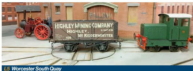
L5 Worcester South Quay

L5 Worcester South Quay Alan Searle A minimum space riverside quay layout, set in the 1930s. The layout represents the final section of the former GWR Worcester Butts branch, which originated from a junction with the GWR Worcester to Hereford mainline, south of Foregate Street Station. Modellers licence has allowed further sidings and a wagon turntable to enhance the scene for operational interest. Trains of general goods can be seen along with cattle wagons to and from the adjacent cattle market. Locomotives and rolling stock are almost entirely kit built with the occasional scratch-built wagon. Control of the track, which is hand-built, and the quayside crane is by DCC using the NCE system. Layout length 7ft. 6in.