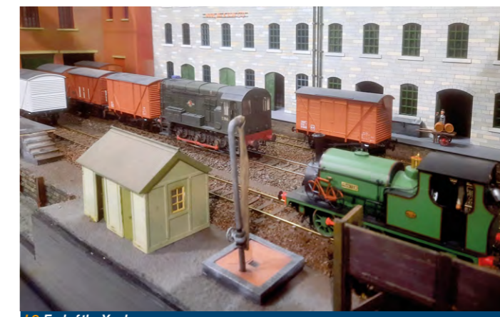
L9 End of the Yard

A small shunting layout, measuring 8ft. X 2ft., set in the late 1960s. The location is fictitious, and does not suggest association with any particular region of BR. Motive power is provided by a couple of elderly tank engines and an 0-6-0 diesel shunter, in green livery and yet to be designated as an 08. The layout backscene depicts a rather foreboding looking and anonymous warehouse. What is stored within is anybody's guess, but whatever it is needs to be transported in covered vans, which proliferate in the shunting yard.