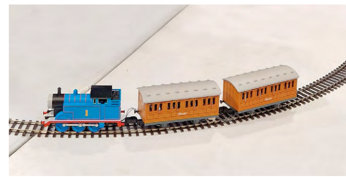
L12 Drive a train Area - Junior Layout.

Now that the Gauge O Guild encourages under 16s to attend our events for £1, it is important that we ensure that our younger visitors have access to an area of interest. The Drive a Train area, which is within the public seating room called Lakeside, provides hands-on experience with a remote control Thomas the Tank and coaches, plus a remote-control Hymek Big Big and some electric G scale Thomas trains as well. There are also some pictures to colour in and stickers to use so please make sure you visit this area. Over 16s have also been known to have fun too.