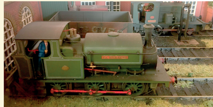
L5 The Loco Yard

Weltham Mitey is a fictitious GWR branch line and terminus station, set in the 1930s in rural Somerset. Goods traffic includes mixed freight, plus milk tankers serving the local dairy. At one end of the layout is a village street scene, with a pub, butcher's and other local shops. The layout measures 27ft. (8,25m) in length, requiring 3 operators.