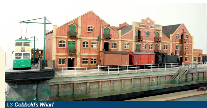
L3 Cobbold's Wharf

A small permanent way engineering yard, set in the 1980s blue diesel era. Rolling stock includes kit-built, scratch-built and RTR. Everything is weathered, to give an overall impression of well-used and well-worn. The layout features items of yellow p-way maintenance equipment.