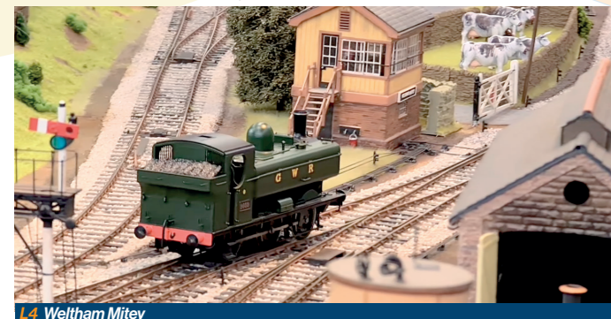
L4 Weltham Mitey

A scale 7 layout depicting an area of Ipswich Docks in the 1950s/1960s. Freight includes timber, oil and unidentified goods in vans, shunted by steam and diesel locos over tracks which criss-cross and weave around the quayside buildings. Look out for the delightfully modelled warehouses and timber storage sheds, plus other finely detailed 'clutter', so typical of this type of environment. You may even spot an Ipswich Corporation trolleybus.