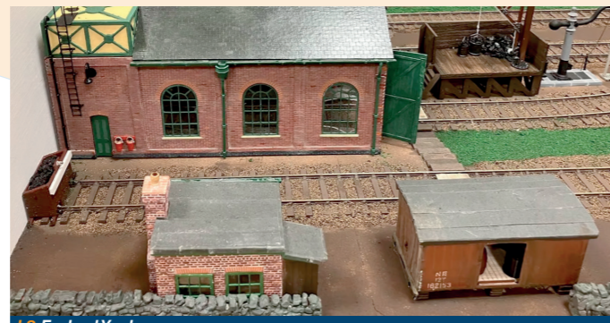
L8 Fenland Yard

This is a reincarnation of the original layout of the same name, which last appeared at Kettering in 2016. The layout is being converted from continuous to end-to-end, with sector plates at each end and a hidden return loop. The period modelled is the late 50s/early 60s, on the Great Central Railway. This is very much a 'work in progress', and the builders will be on hand to discuss every aspect of layout design and build for exhibition use.