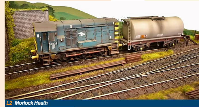
L2 Morlock Heath

Here is an opportunity to test run your own locos or try out your intended purchases. Most wheel standards are catered for (except S7 or coarse-scale), and the track has facilities for 2-rail, stud contact or 3rd rail, at 12 or 24vdc. It is also wired for DCC. Clearances between running lines allow for 16mm scale running on 32mm track. The live-steamers will be in attendance, providing some spectacular running.