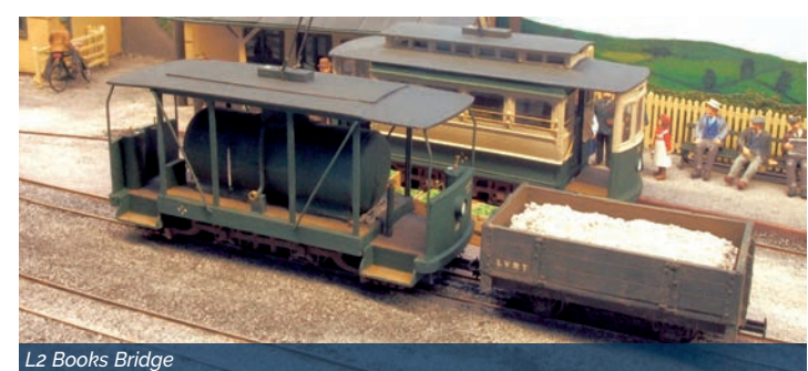
L3 The Wagon Works 7mm Finescale

Books Bridge is loosely based on the Kinver Edge Light Railway, an electric tram that ran from the outskirts of Dudley to Kinver close to the Kinver Edge. The layout is set in rural Suffolk South of Bury St. Edmunds depicting the southern terminus of the Lark Valley Railway, previously a steam tramway, but now electrified, that follows the River Lark to where it joins the Great Ouse at Mildenhall. The layout, measuring 8ft.6in. x 1ft.3in. (2590 x 385mm) features working overhead electrics.